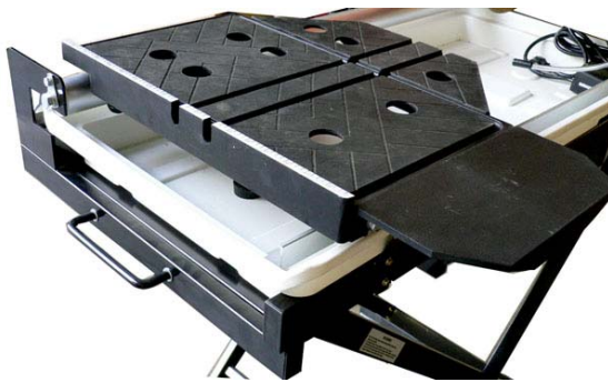
Worktable with two cutting slots